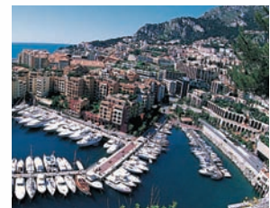
Monte Carlo, in the Principality of Monaco, is one of Europe's gems by the sea.