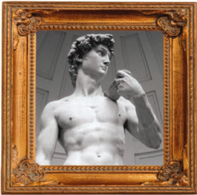
Michelangelo's David in Florence, Italy. A masterpiece in Marble.

Next year, set sail on a voyage like no other. For the very first time, the wonders of a Disney cruise have been combined with some of Italy, France and Spain's most picturesque ports. Come explore breathtaking European destinations on an incredible family vacation filled with the magic, charm and world-famous service of a Disney cruise.