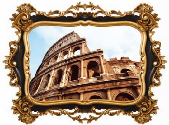
The Roman Coliseum – arguably the world's most recognizable ruin.

most jaw-dropping vistas and all the must-see marvels. Summer 2007, come with us on the most incredible Disney cruise yet. The Mediterranean will never get more magical than this.