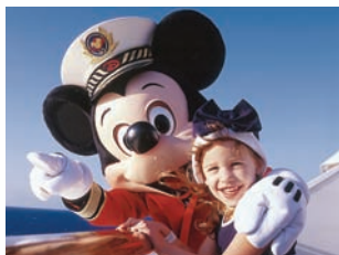
Join Captain Mickey on an enchanting European voyage on the Disney Magic .