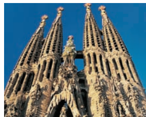
Barcelona's Sagrada Familia basilica – begun in 1882 and still under construction.