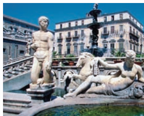
Palermo, capital of Sicily, offers a visual feast of art and architecture.